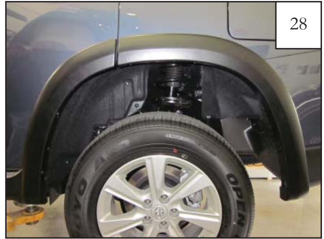
Completed Door Piece Installation.