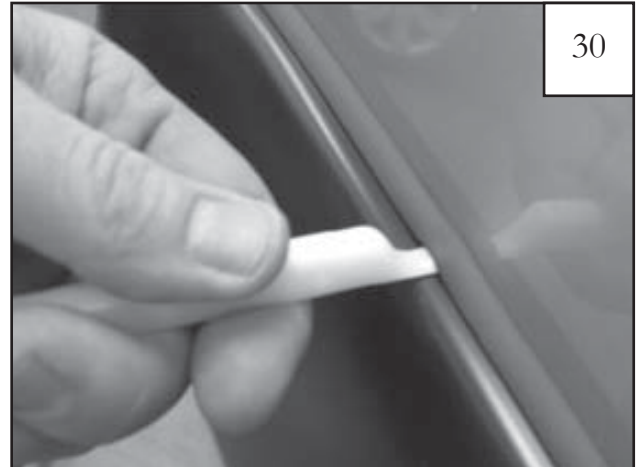
Using flat end of supplied Edge Trim Tool (ET1-0002), seat edge trim against flare by inserting straight end between edge trim and flare at one end. Next, slide around entire edge to the other end.