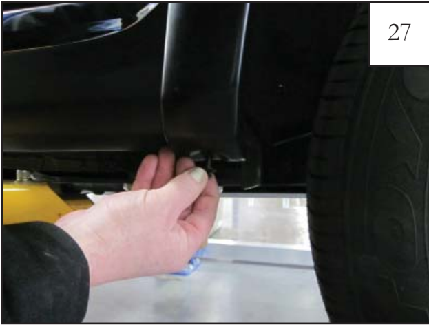
Install a Tuflock (RV1-P001) through hole drilled in previous Step.