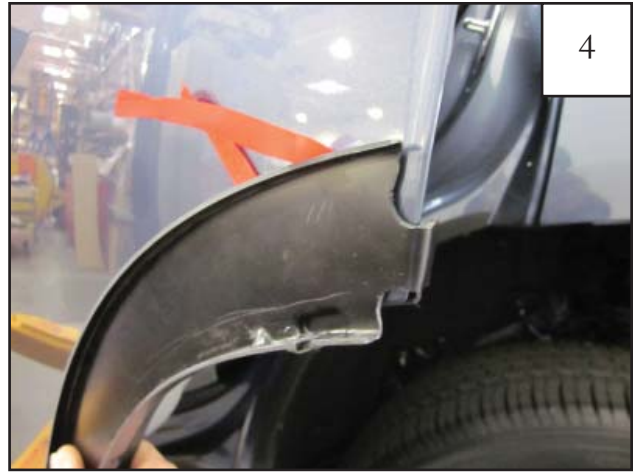
Open rear door and position Inner Door Piece on door. At top of part, align Inner Door Piece such that the breakaway tab hooks over the door lip.