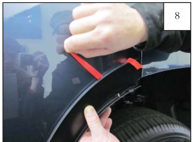
Pull red tape liner on the left (tape closest to edge of door).