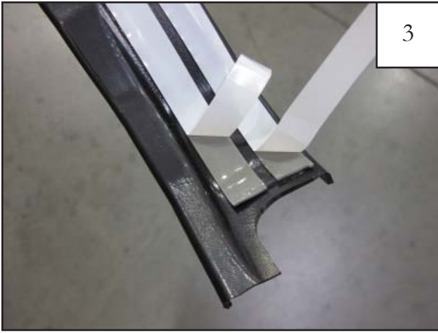
Start to peel white vinyl liner from tape at bottom of Inner Door Piece, folding tabs toward the outer curvature of the part and ensuring that inner liner is behind the outer liner.