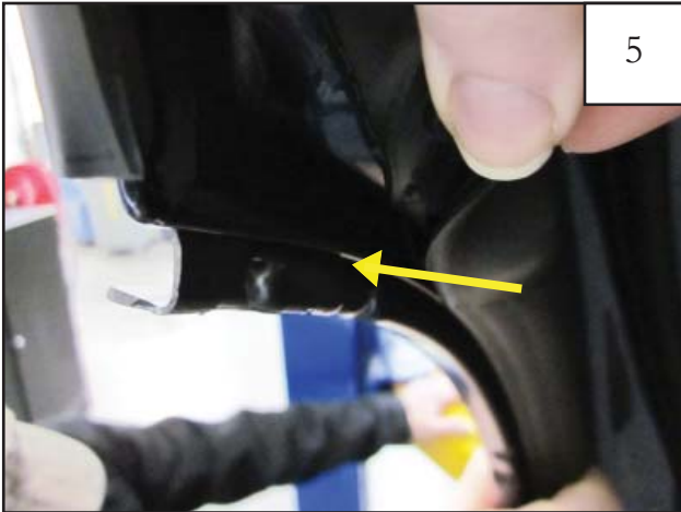
Pull gasket up to expose edge of door. Align Inner Door Piece Indexing Bump with edge of door.