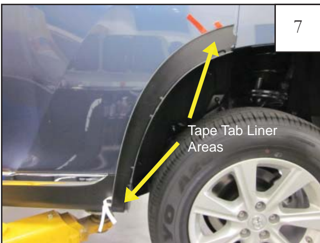
Ensure that tape tabs are accessible, top and bottom.