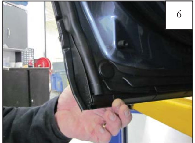
At bottom of part, align Inner Door Piece to nest snugly to lower curvature of the door.