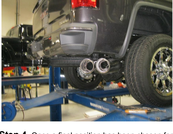
Step 4. Once a final position has been chosen for the new exhaust system, evenly tighten all clamps from front to rear using the torque specifications on page one of the instructions. Inspect all fasteners after 25-50 miles of operation and re-tighten if necessary.