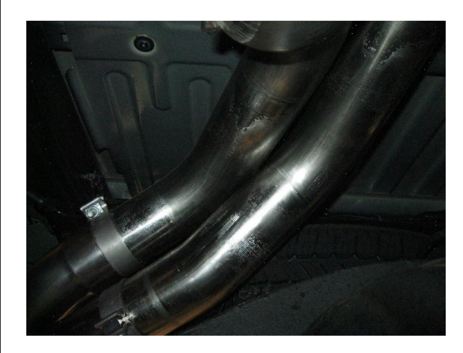
Step 3. Next Install the Tail Pipe Assembly to the Extension Pipes in a similar fashion using the supplied 3.50" clamps and by fitting the welded hanger clamp into the rubber insulators.