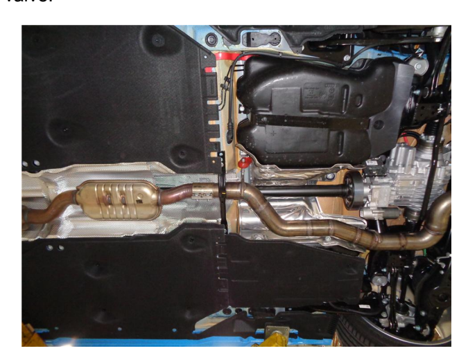
Step 5. Loosely attach the Inlet Pipe Assembly to the OEM slip clamp. Engage the welded hangers to the rubber insulators.