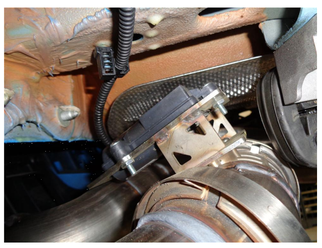
Step 6. Loosely install Muffler Assembly using the supplied V-Band clamp. Attach the welded hangers to the rubber insulators. Re-attach both electrical connectors to the exhaust valve motors. **NOTE: Take care when using the V-Band Clamps, they are designed for one time use only. Once the clamp is tightened it can not be reused.