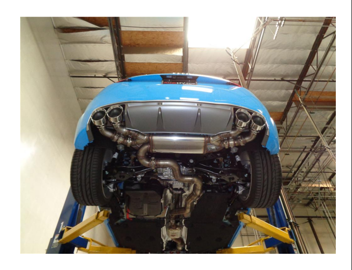
Step 7. Once a final position has been chosen for the new exhaust system, evenly tighten all clamps from front to rear using the torque specifications on page one of the instructions. Inspect all fasteners after 25-50 miles of operation and re-tighten if necessary.