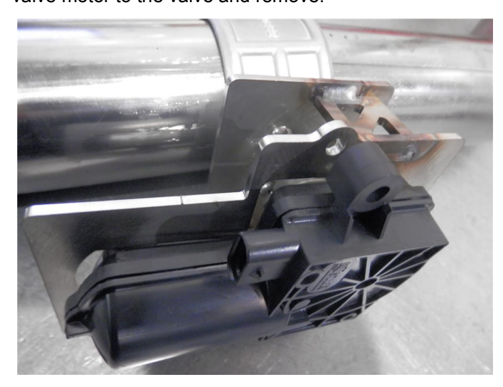
Step 4. Before installing your new exhaust system attach the OEM valve motors to each valve using the supplied hardware. The alignment spring on the motor will need to be engaged into the keyway slot of the new valve.