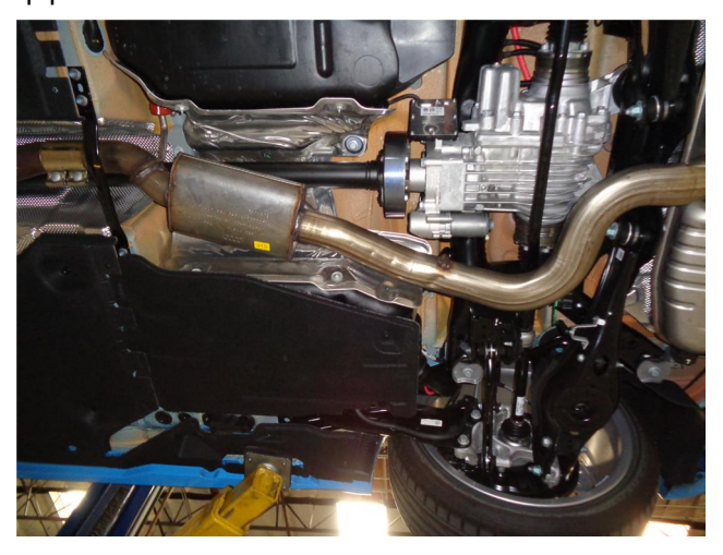
Step 2. Begin removal of the OEM system by loosening the slip clamp at the vehicles exhaust inlet. Working front to rear disengage all welded hangers from the rubber insulators. Be sure to retain all mounting hardware as it will be needed to mount your new MAGNAFLOW exhaust.