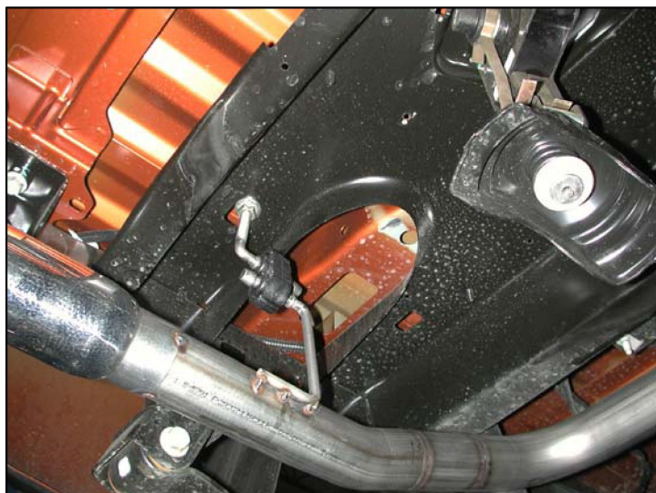
FIG. 2 - Driver's side

Warning: When working on, under, or around any vehicle exercise caution. Please allow the vehicle's exhaust system to cool before removal, as exhaust system temperatures may cause severe burns. If working without a lift, always consult vehicle manual for correct lifting specifications. Always wear safety glasses and ensure a safe work area. Serious injury or death could occur if safety measures are not followed.