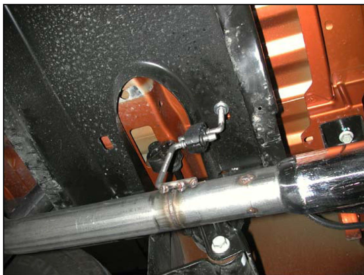
FIG. 1 - Passenger's side